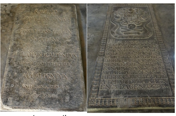
a gravestone on the church floor

Thereafter we visited the Old Dutch Reformed Church which was close by, within the town. The church had been renovated with a new roof. The old belfry was located in the walled churchyard which also contained many monuments. The inscriptions, both in Dutch and English, found on the large gravestones on the floor of the church were examined with interest.