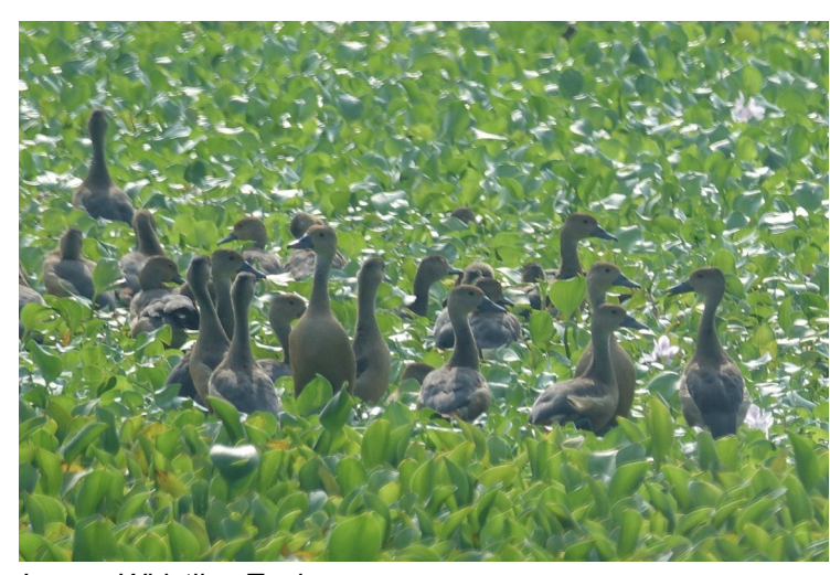
Lesser Whistling Teal