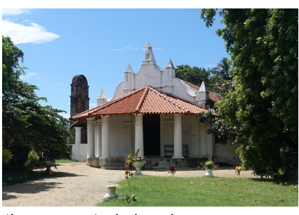
the renovated church