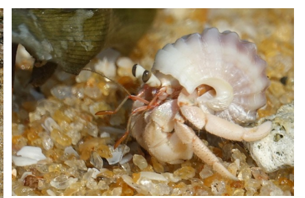
a hermit crab at Uchchimunai peeps out of its shell