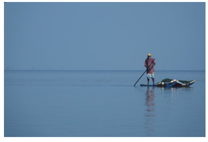
traditional fisherman on vallam