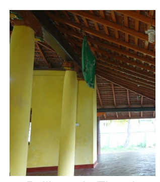
at Palliwasala Thurai

On the way we stopped to visit the ruins of the Alirani Palace, which turned out to be hardly of any interest - in fact we wondered if we were shown something else by the locals. Also a mosque at Palliwasala Thurai that bears a unique architectural style, featuring Dutch style verandahs, doors and windows, combined with wooden pillars with Kandyan style pekada, painted in green and orange. This mosque house the tombs of two muslim saints. The caretaker kindly obliged us by showing us the insides of the tombs and explaining their significance.