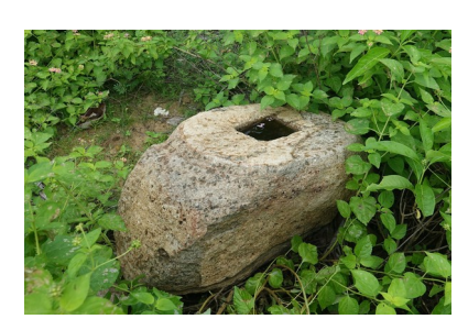
one of the very few remnants of ruins at Alirani Palace

On the way we stopped to visit the ruins of the Alirani Palace, which turned out to be hardly of any interest - in fact we wondered if we were shown something else by the locals. Also a mosque at Palliwasala Thurai that bears a unique architectural style, featuring Dutch style verandahs, doors and windows, combined with wooden pillars with Kandyan style pekada, painted in green and orange. This mosque house the tombs of two muslim saints. The caretaker kindly obliged us by showing us the insides of the tombs and explaining their significance.