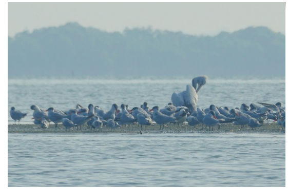
Spot Billed Pelican, Caspian Terns & others on a sand bank

We journeyed on into Portugal Bay and on towards Battalangunduwa passing by the "moya kata", the lagoon entrance to the Indian Ocean.