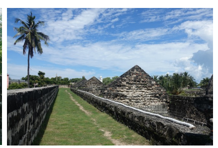
rampart & storehouses