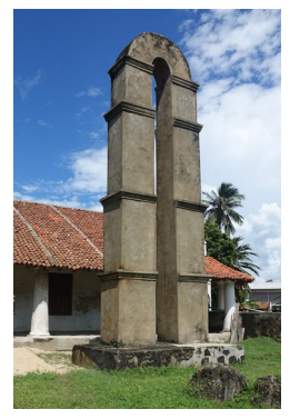
the bell tower on the left side