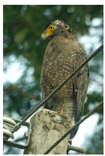
Crested Serpent Eagle