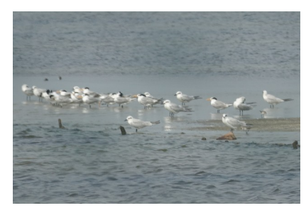
Greater Crested Terns & others

We stopped briefly at the Palavi Salterns to look at the few birds seated along the bund of the salt pans. Caspian Tern, Greater Crested Tern, Black Winged Stilt and Common Sandpiper were among the birds that could be readily identified while the others could not be seen clearly being further afield in the haze. Birds were very sparse in number due to the high water levels. So we journeyed on.