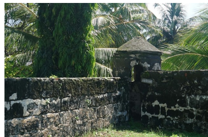
one of four corner guard-houses