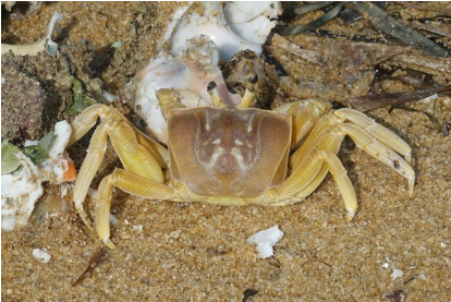
a crab on the beach at Uchchimunai