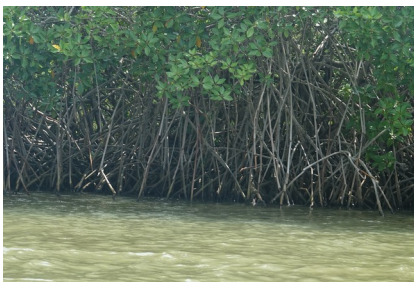
mangroves with buttress roots