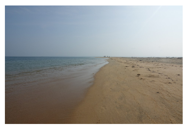
the beach at Uchchimunai with the SLNHS wanderers far away at the horizon