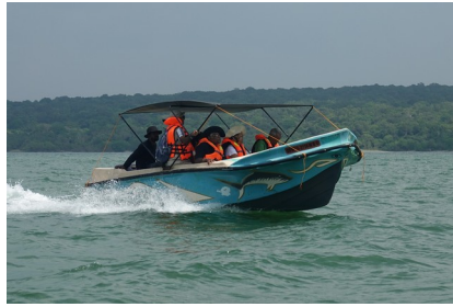
Wilpattu NP in the background