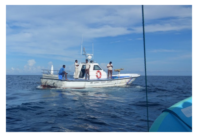
the Coast Guard checks on us