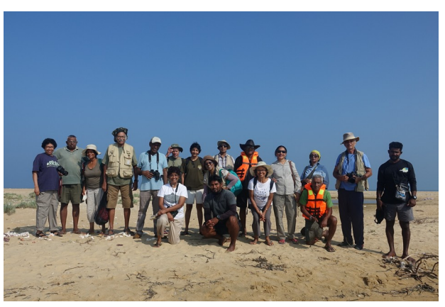
the SLNHS wanderers at Uchchimunai

The Dutch Bay is an arm of the sea separating Wilpattu and Puttalam from the peninsula of Kalpitiya. It is about 18 miles long and about 2-6 miles broad. It is studded with several islands and sand banks, such as Bird Island, which are uninhabited. Portugal Bay lies north of Dutch Bay.