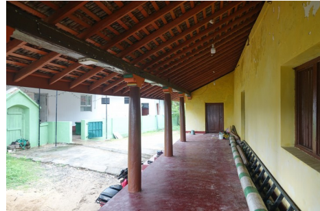
at Palliwasala Thurai