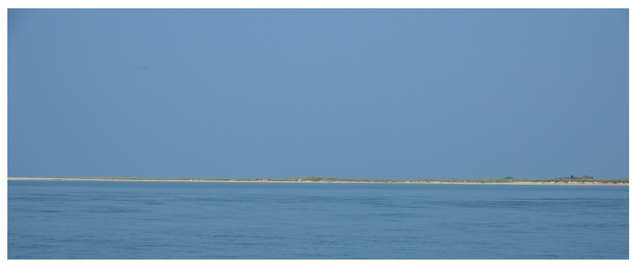
the first view of Battalangunguwa Island at its southern-most point

The sea continued to remain calm as the three boats sped on towards Battalangunduwa. We slowed down, when required, and observed the areas of interest that were pointed out by our boatman, Priyantha, and disembarked at Periya Gunduwa and Sinna Gunduwa. We visited the church and examined the discarded shells and dried up starfish lying in middens along the beach, remnants of the by-catch of the fishermen. Doc Malik and a few other picked up some shells for further study.