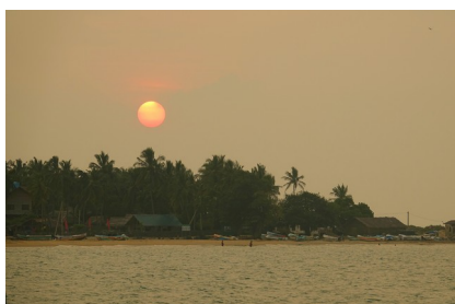
off to the beach