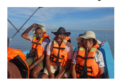
the Dolphin watchers

The day dawned with clear blue skies as we had our early morning tea and biscuits at 0630 hours. We drove down to the Dolphin Wadiya and six of us took off by boat at 0730 hours to watch the dolphins. The rest explored the beach and the sand dunes for birds, crustaceans, molluscs and coastal vegetation before heading back for breakfast.