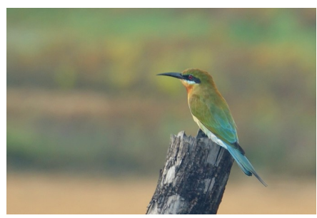
Blue Tailed Bee-eater