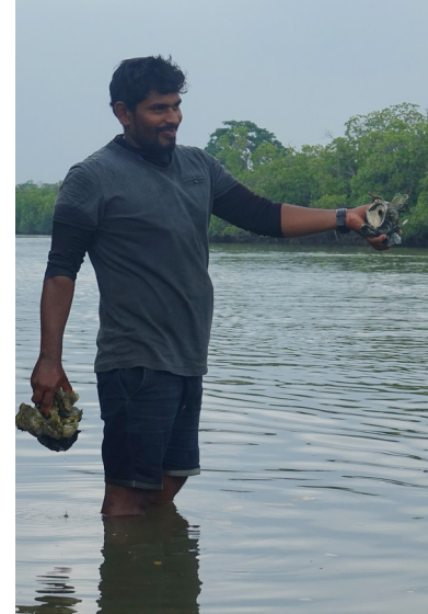
dead oyster shells