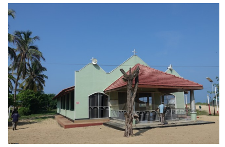
the church at Periya Gunduwa