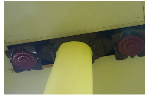
Kandyan Style Pedaka at Palliwasala Thurai