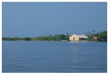
the church at Palli Thurai