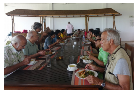
Lunch-time at Kincha

We stopped for lunch at about 1230 hours at Kincha located at Madurankuliya, past the 101 Km post. It was a rather unappetizing rice and curry buffet with "something" soup (it turned out to be pumpkin and garlic). A few opted for, a rather expensive, fish and chips and others for vegetable sandwiches. Patrons are forewarned to obtain prior confirmation of the prices of their order since the prices of the off-menu items seem to be variable and subject to the wild fancies of the management. The only plus points were the clean washroom facilities, spacious dining area and adequate parking for vehicles.