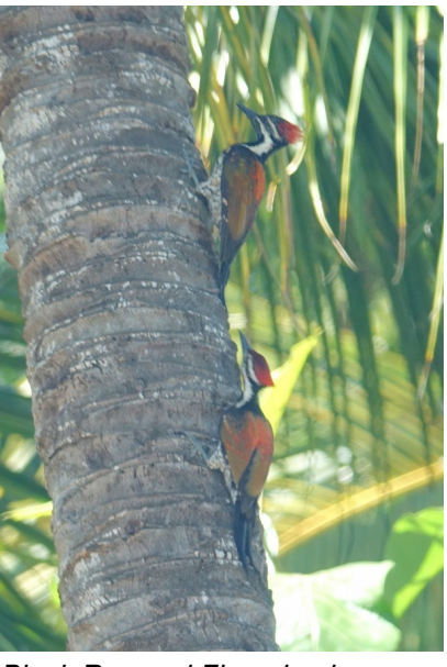
Black Rumped Flamebacks seen outside the Fort

We were escorted into the premises and walked about the fort exploring its innards. It is a four-sided, four corner bastion type fort, built of coral masonry, 350 feet each way with 20 foot high ramparts. The main gateway, with the date 1776 and VOC emblem carved above and the date 1760 carved directly on the wooden gate, faces the quay and the jetty as the main aim of the fort was the protection and maintenance of trade along the water with other ports in the East, including India and the Indian Ocean. The main structures, consisting of a parade ground, barracks, warehouses, ramparts, bastions, 30 gun embrasures and sentry boxes were found to be in sound condition and were readily discernible. However, we could not explore the magazines as they were blocked off.