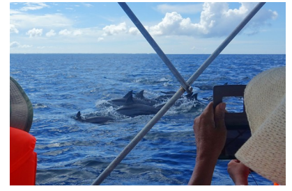
up close again