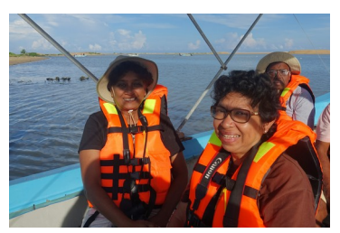
more Dolphin watchers