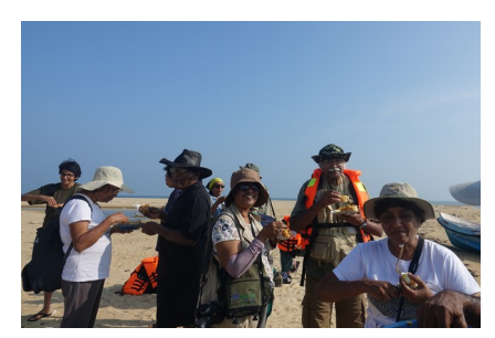
breakfast at Uchchimunai beach