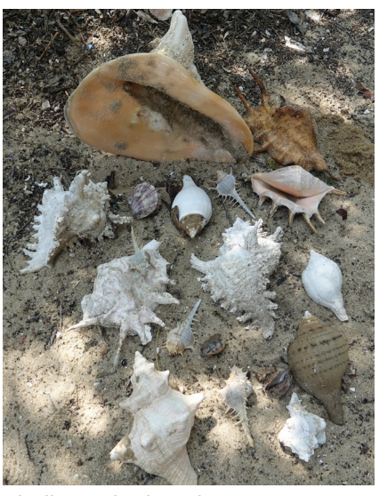
shells on the beach

Thereafter, we crossed Portugal Bay towards the mainland, viewing Kudremalai Point in the distance, and journeyed south along the coast bordering the Wilpattu NP.