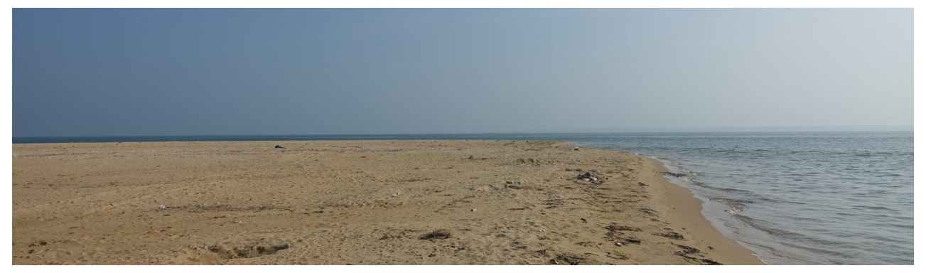
Uchchimunai, the northern-most point of the Kalpitiya Peninsula