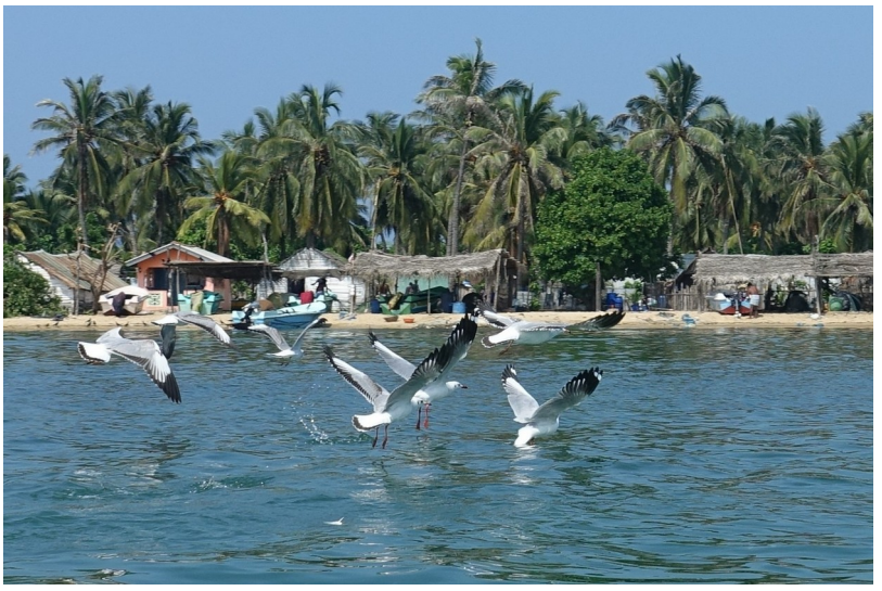
Brown Headed Gulls