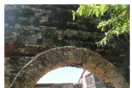
the entrance doorway at the eastern entarnce