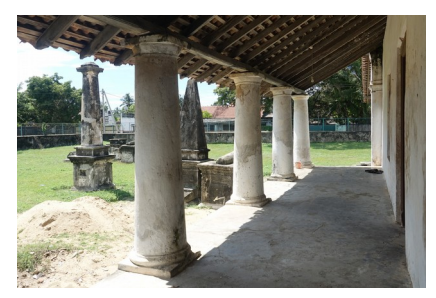
side verandah with monuments in the garden

Thereafter we walked down to Elite Restaurant, which was close by, for lunch. After lunch we drove back to our abode. Since we had covered all that which we had planned to visit, a decision was taken to pack up and leave, cutting short our visit by one day. This move turned out to be wise since evening thundershowers set in a short while after we left.