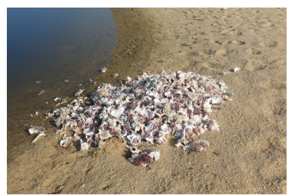
mollusc shells on the beach