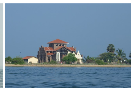
church close to Uchchimunai